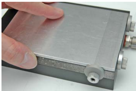
Fig. 5: Clamping the workpiece