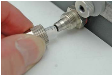
Fig. 2: Connect the vacuum hose