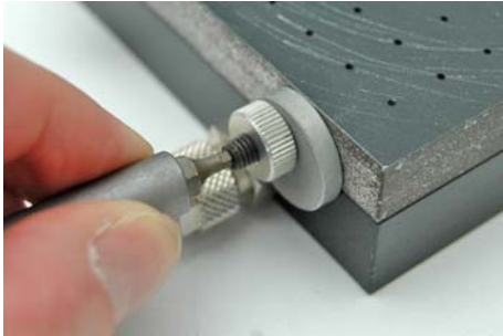
Fig. 3: Install the set screw